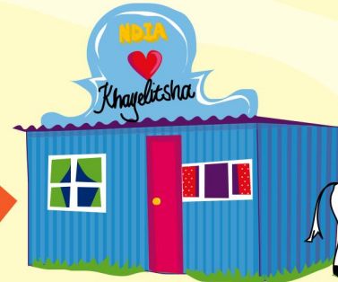
Products woven in Khayelitsha